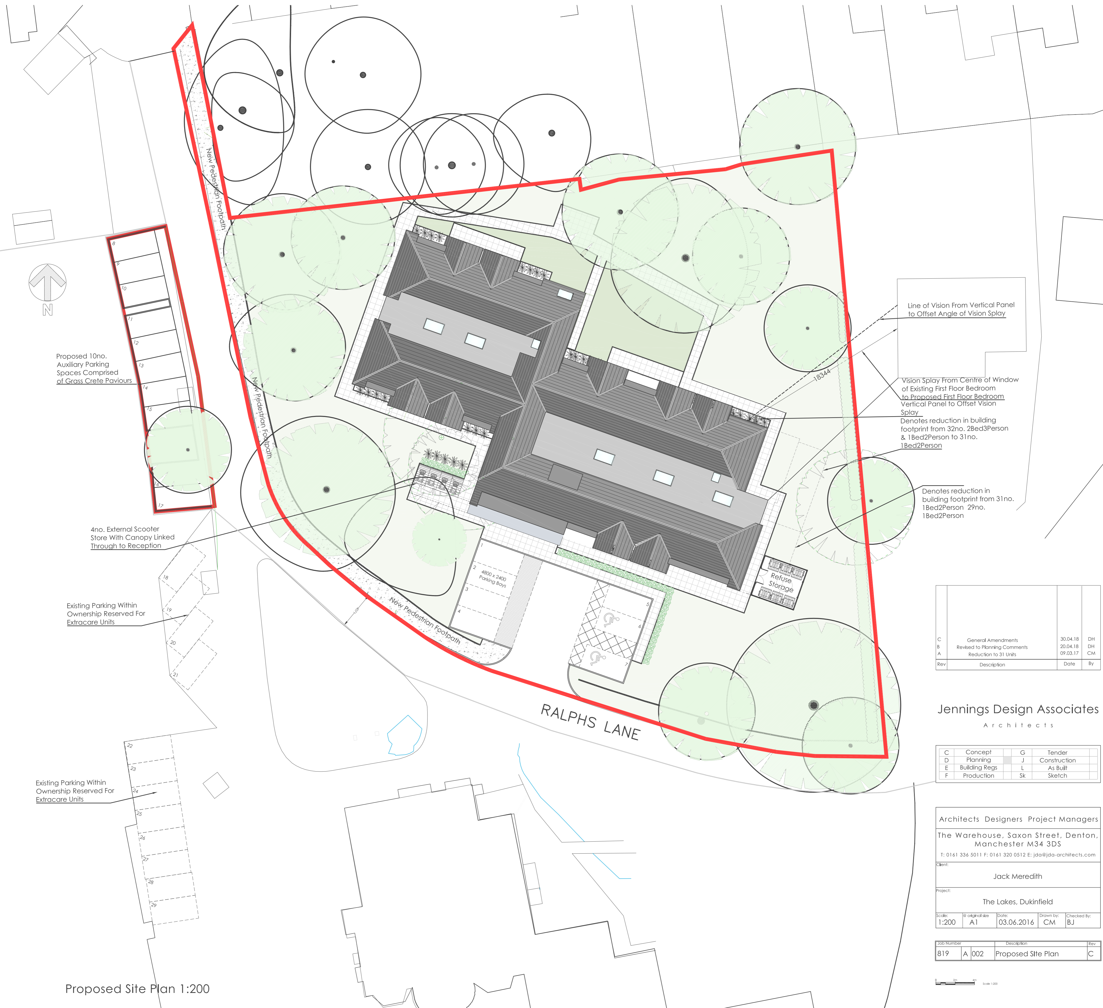
Proposed Site Plan 1:200

Denotes Area of Massing Removed Due to Reduction of Units From 31 to 29 no. 1 Bed 2 Person Units